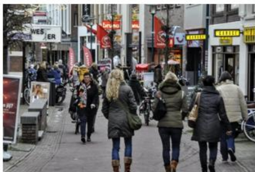
Shopping in Barneveld