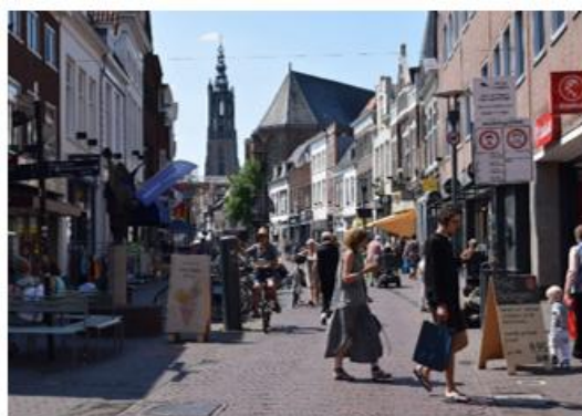
Shopping in Amersfoort