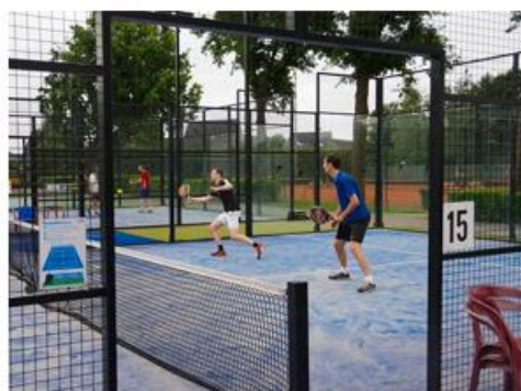
Sport in Barneveld