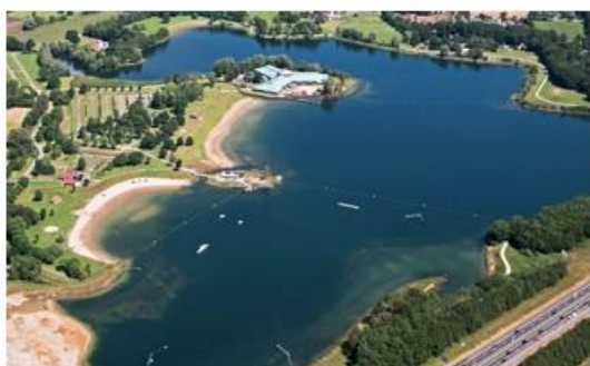
Watersport at Zeumeren