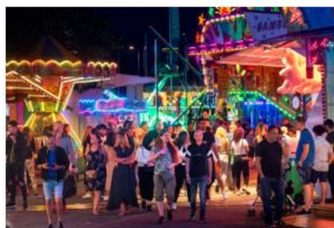
Braderie & Kermis in Voorthuizen